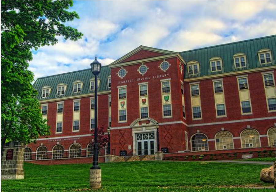
Physical Collection (the Library)